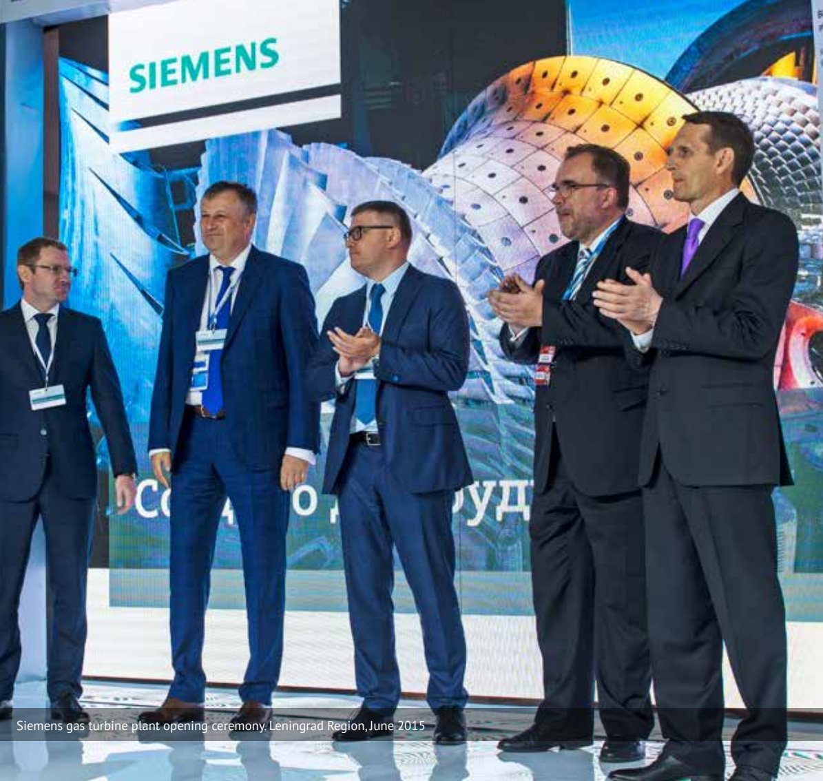
Siemens gas turbine plant opening ceremony, Leningrad Region, June 2015